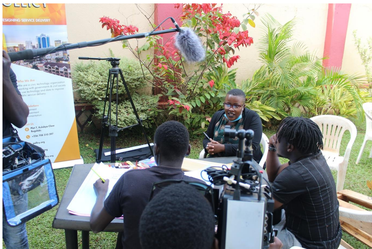
The Communications Act, 2013

The Communications law prohibits broadcasting content 17 or operating a cinematograph theatre or a video or film library without an appropriate license 18 . The Uganda Communication Commission established under this law has been conferred with powers to monitor, inspect, license, supervise, control and regulate communications services, including internet platforms. 19 The downside of this provision is that the Commission is required to issue the license on discretionary terms i.e. on terms and conditions it may consider necessary and reserves the right to revoke a license.